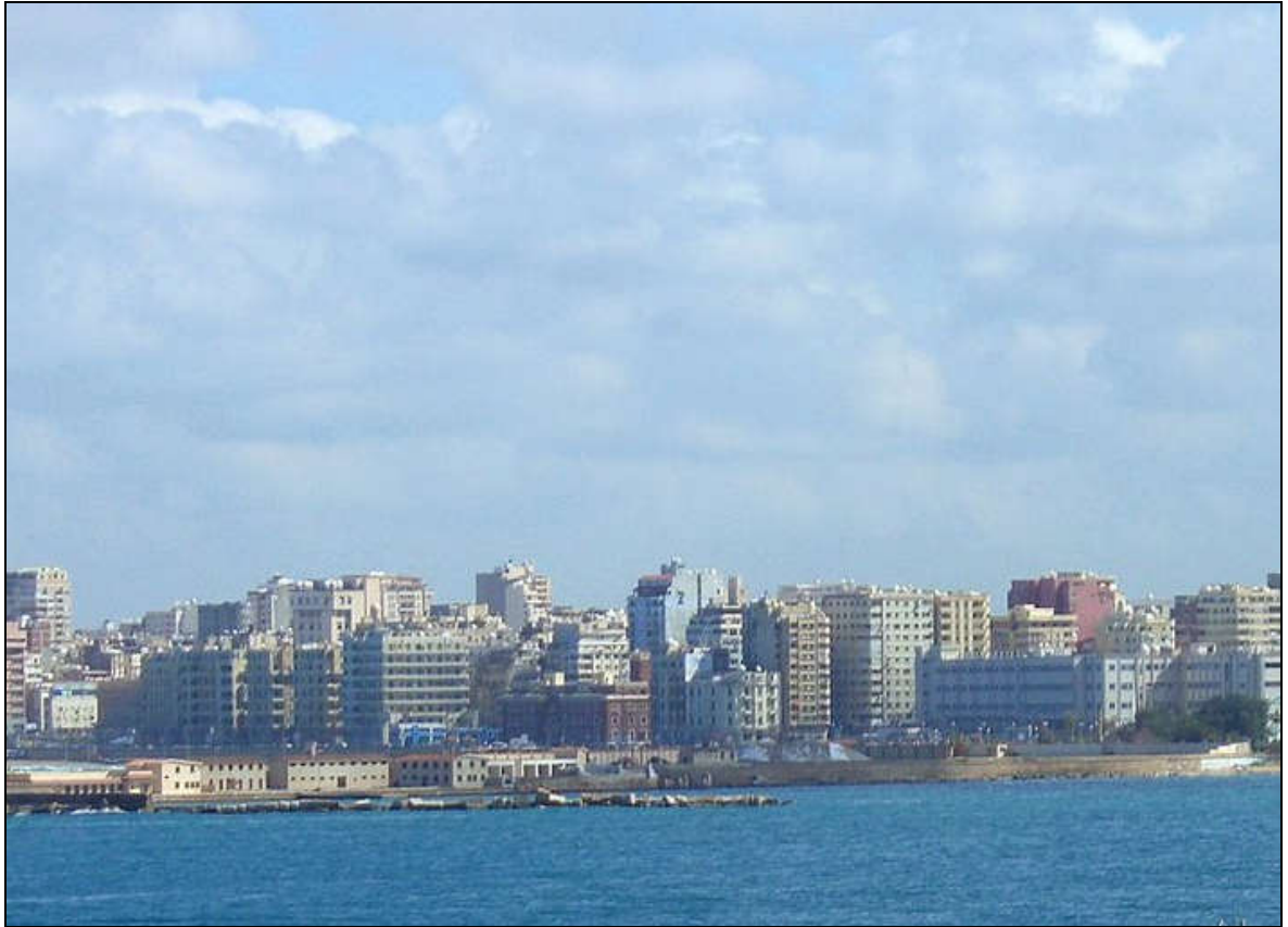
Alexandria, the capital of Roman Egypt — Origen's birthplace