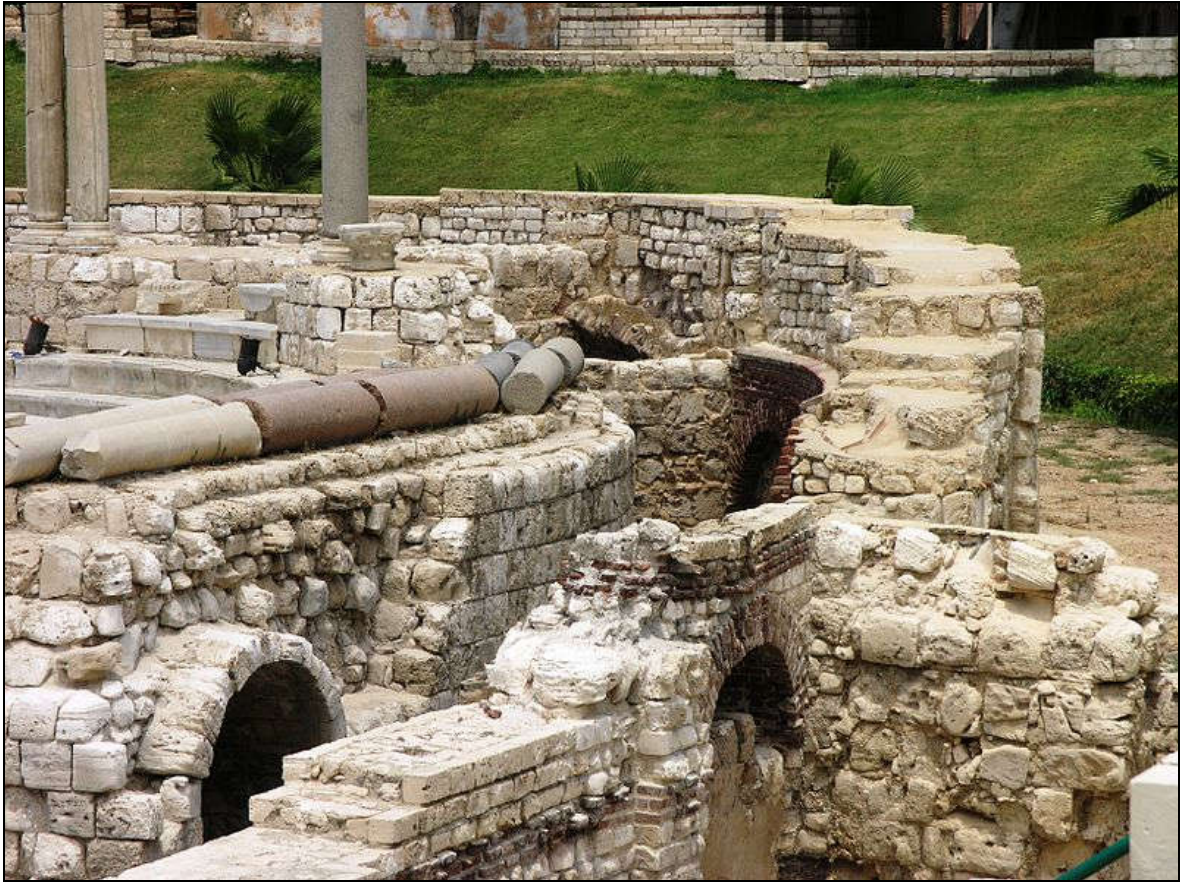
Roman ruins at Alexandria