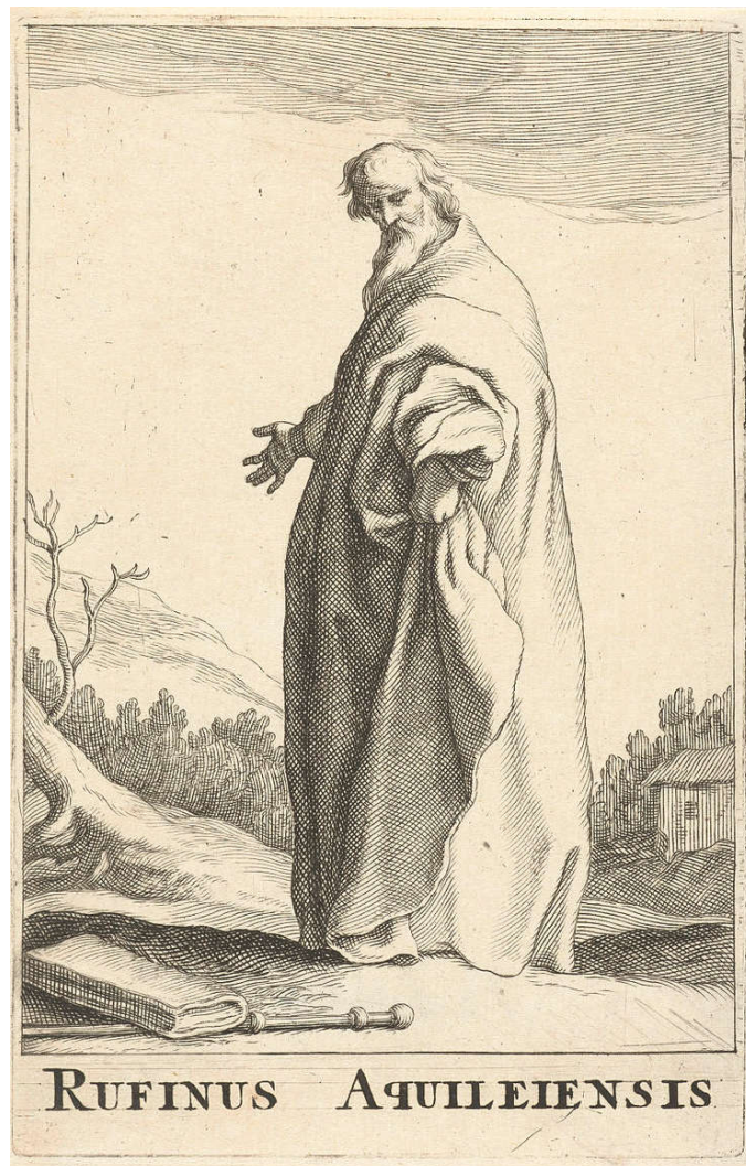
Frederick Bloemaert's seventeenth century depiction of Tyrannius Rufinus (344/345-411), who was a monk, historian and theologian. He is best known as a translator of Greek patristic material, especially the work of Origen into Latin.